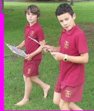
Scavenger hunt on the first day of term