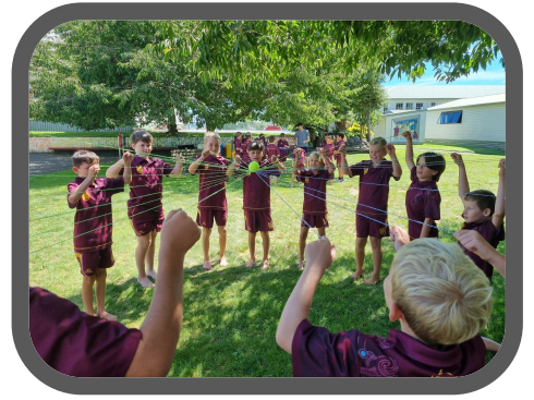
The string lifter

The children have been exploring, problem solving, team building and getting to know each other in true Room 3 style.