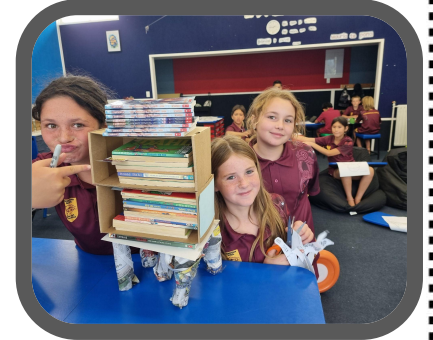
The strongest paper table